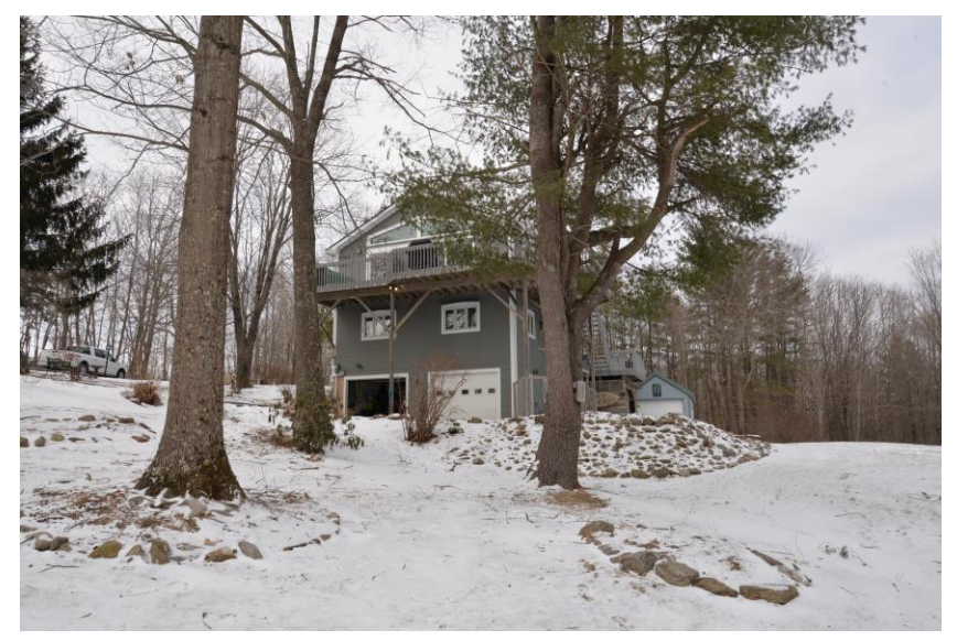
Figure 2 – Photograph showing the exterior of the home at the garage.

The home consists of a first and second floor living space with a finished basement, the garage being located in/on the basement level. On the exterior of the home, there are decks on the first and second floors which are connected and have ground level access. A small fenced in area, appearing to be a dog run is located to the right of the garage. Inside of the fenced area, a door provides access to the garage.