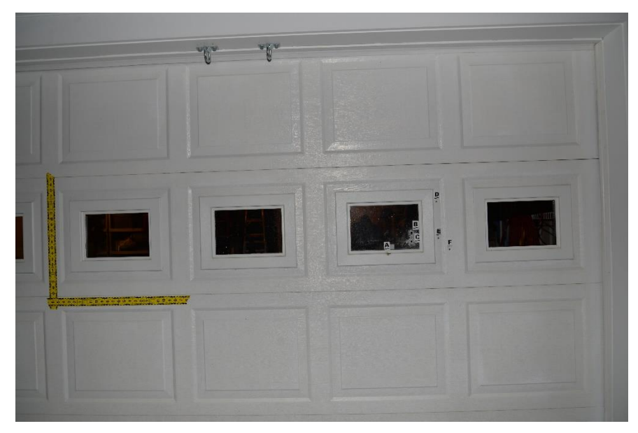
Figure 6 – Photograph showing damage to the right garage bay door.

The second window from the right, on the right garage bay door showed evidence of the six shots fired by Sergeant Sanctuary.