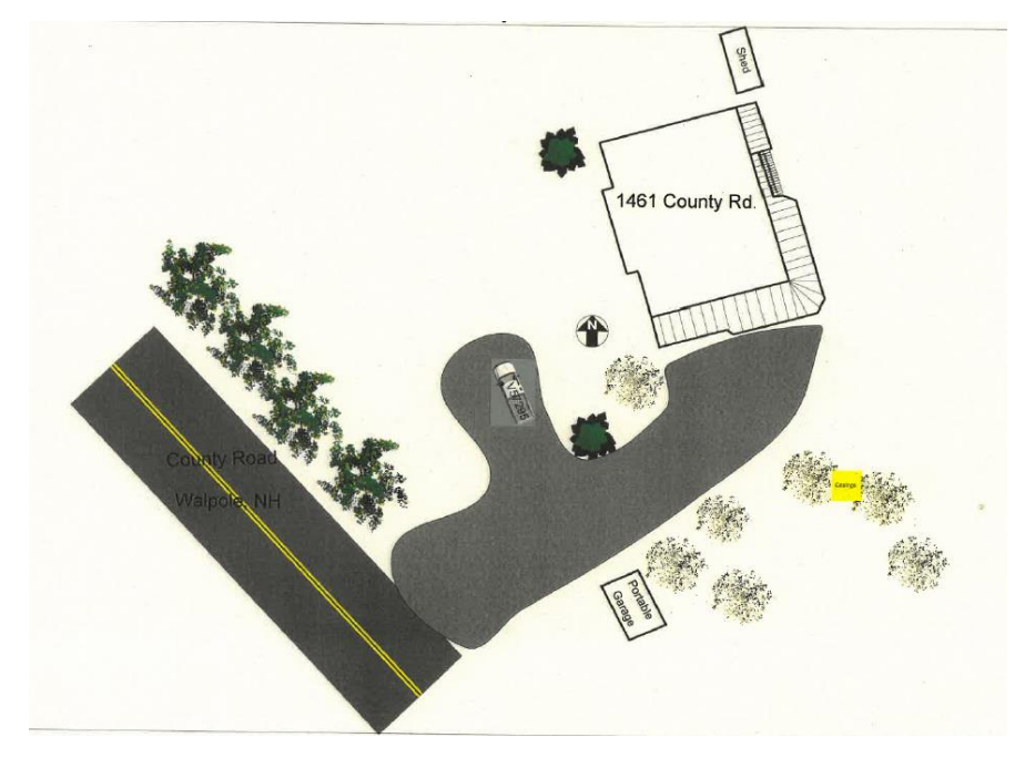
Figure 4 – NHSP diagram showing the exterior of 1461 County Road