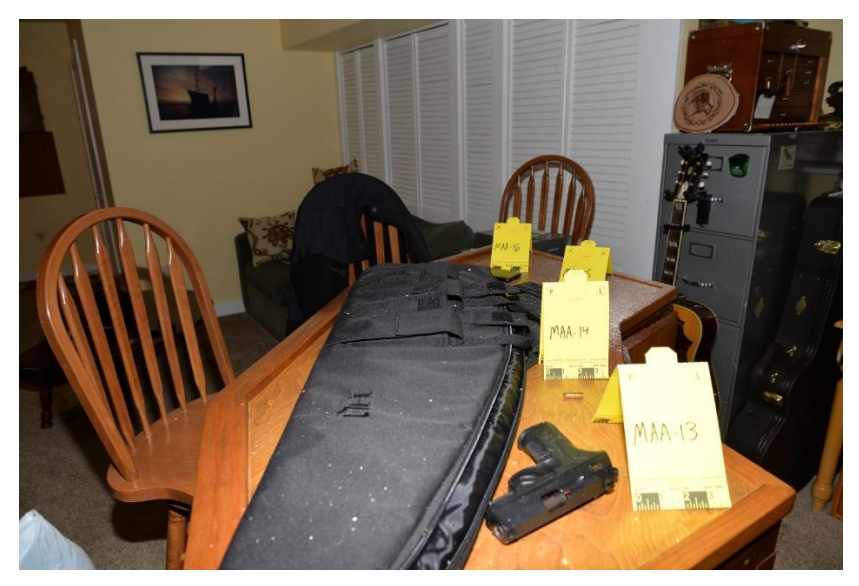
Figure 8 – Photograph showing the recovered Beretta PX4 pistol