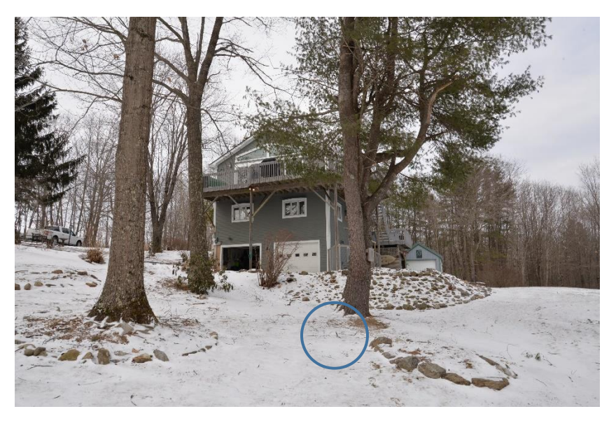
Figure 2 – Photograph showing the exterior of the home at the garage. The blue circle shows the approximate location from which the casings were recovered.