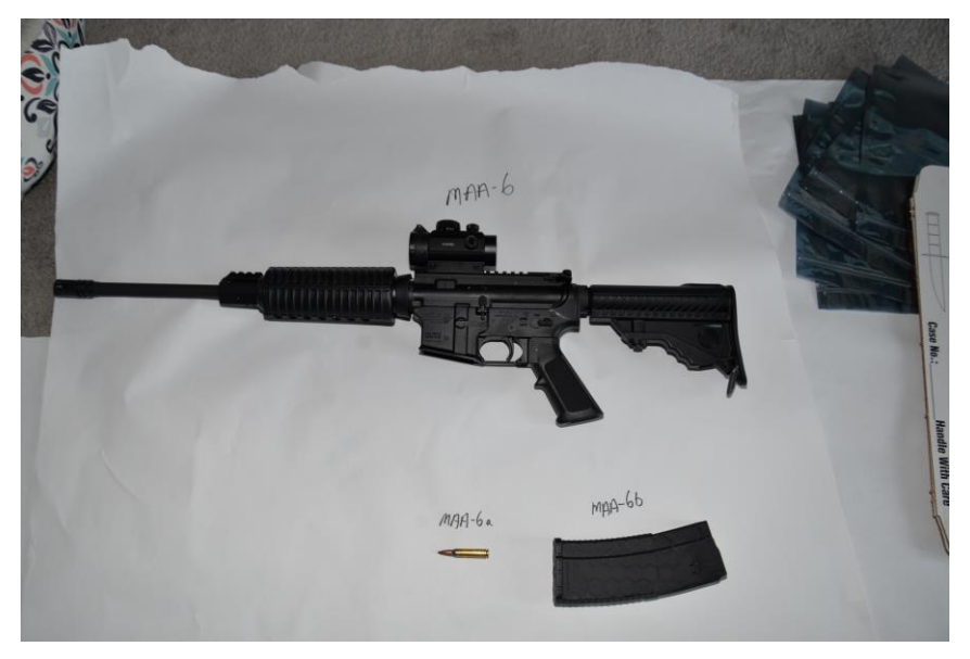
Figure 7 – Photograph showing the recovered Panther Arms rifle

one round in the chamber. The rifle was equipped with a 1x40RD tactical scope. The Bureau of Alcohol, Tobacco, Firearms, Explosives (ATF) National Tracing Center report shows that this weapon was purchased by Mr. Tkal on December 17, 2018.