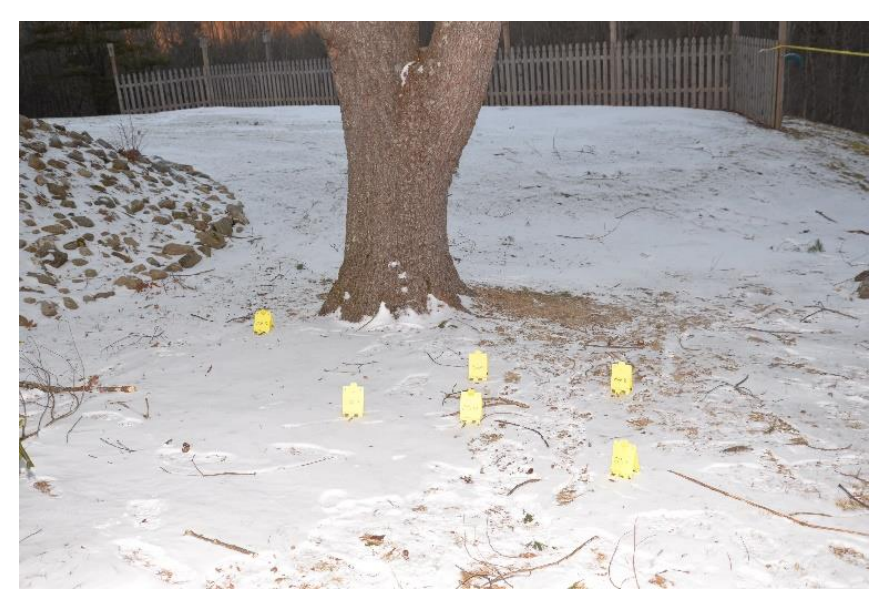
Figure 5 – Photograph showing the locations of the six recovered casings.

The second window from the right, on the right garage bay door showed evidence of the six shots fired by Sergeant Sanctuary.