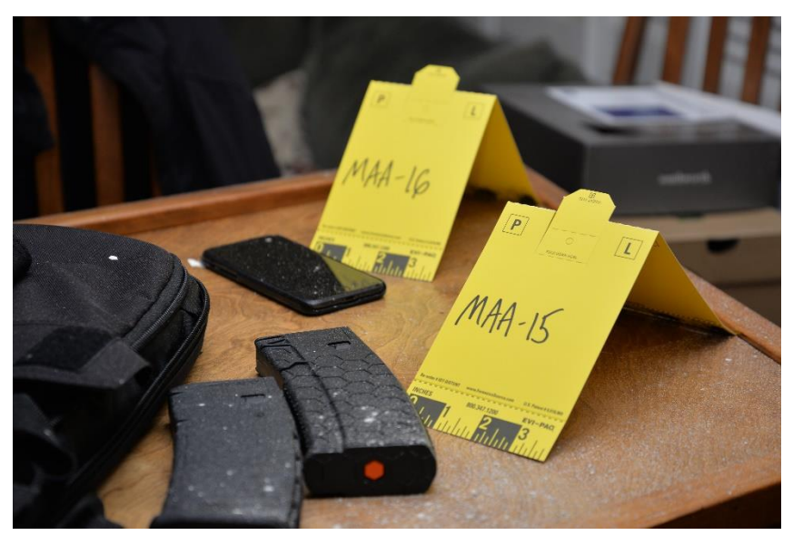
Figure 9 – Photograph showing the recovered magazines

Also recovered from inside of the home were several knives as well as prescription bottles for medication prescribed to Mr. Tkal.